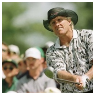
Exhibit A for this argument is of course the Tiger Woods effect. Tiger's dominance of men's golf from 1997 had a profound impact on the perception of the sport and drove the economy of golf to new heights. Between 1997 and 2010 he won 13 of golf's major championships (including 7 of the 11 contested from August 1999 to June 2002). Tiger broadened the appeal of golf and much of the

money (sponsors, TV, endorsements) in the game today can be attributed to his career.