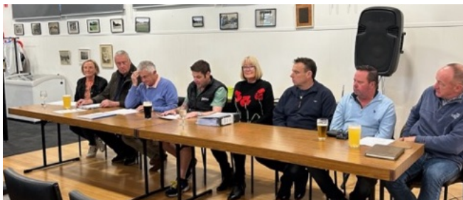
The Committee nervously waits to judge the temper of the meeting.