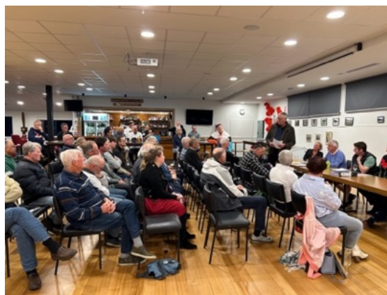
The crowd breathlessly awaits the next award winner!