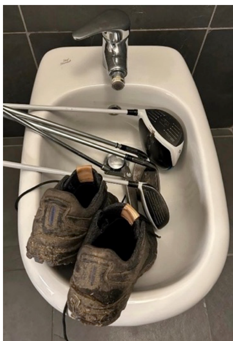
The bidet and the bell!