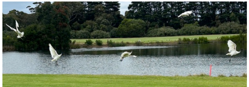
The rarely seen (at Sandy) dance of the ibis!