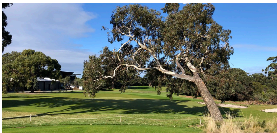
Looking towards the 9 th green from the 4 th tee.