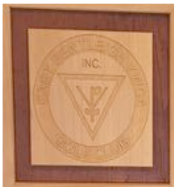
East Bentleigh YWCA Golf Club