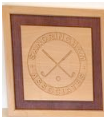
Sandringham Associates Golf Club