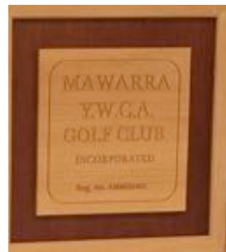
Mawarra YWCA Golf Club