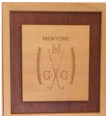
Mentone Ladies Golf Club